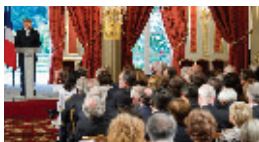
Kick Off meeting – Palais Elysée Paris June 2010