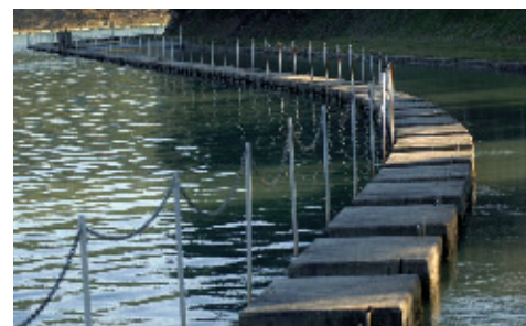
Settling Tank, Aix-en-Provence

TIME FOR SOLUTIONS Marseille > March 2012