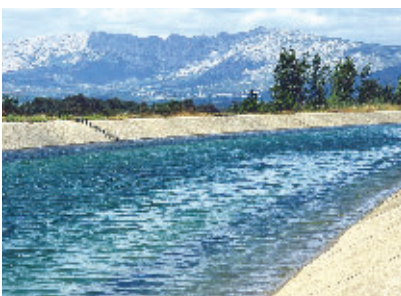
Canal of Provence