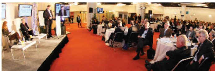
Paris – January 2011