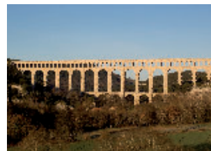
Roquefavour Aqueduct, transporting water from the Durance to Marseille