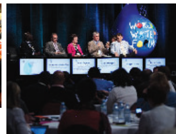
Lyon – May 2011