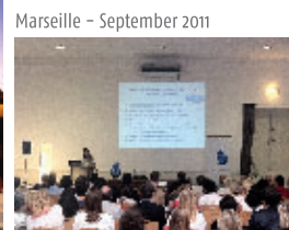
Marseille – September 2011