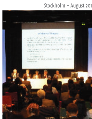
Stockholm – August 2011