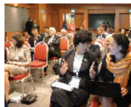
Singapore – July 2011