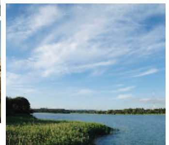
Réaltor Tank, near Aix-en-Provence