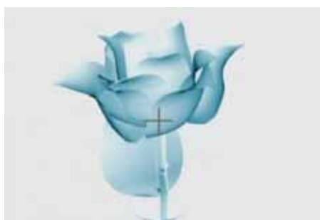
WASH Prize "Providing water, sanitation and hygiene" "In the name of the roses" Thierry Berrod France (2008) 52 min