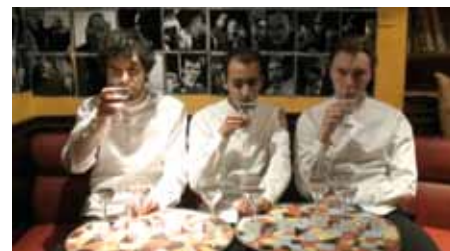
Jury prize "Les goûteurs" (The tasters) Eau de Paris