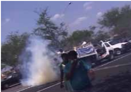
Bronze Drop – INBO Prize “13 villages defending earth, air and water” Francesco Taboada Mexico (2007) 60 min