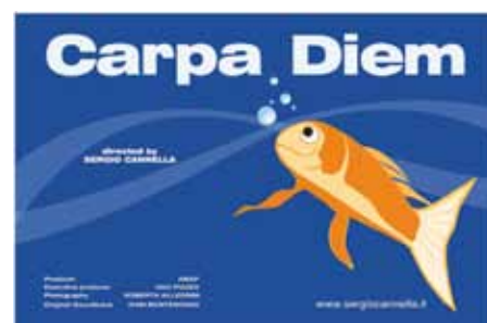
Bronze Drop International Office of Water “Carpa Diem” Sergio Cannella Italy (2006) 2 min