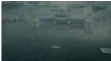
Ouranos Prize "Climate change" "Het verloren land" Jos de Putter Netherlands (2007) 55 min