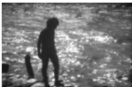
Special Mention "Una mancha en el agua" Pablo Romano Argentina (2006) 20 min