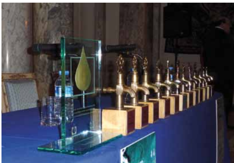
IWFE Trophies, Istanbul 2009.

One of the most recent events, the Paris Water and Film Events held from 18-25 March 2010 at the Water Pavilion in partnership with Eau de Paris, screened 43 films with preview screenings, conference-debates with the public and a VidéEau competition run in partnership with Dailymotion: 75 films on the theme of "Water and Paris". A 2 nd edition will take place from 18 to 22 March 2011.