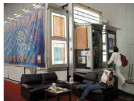
The movie theater 'The Wagon' where the screenings during the Forum in Mexico took place, 2006